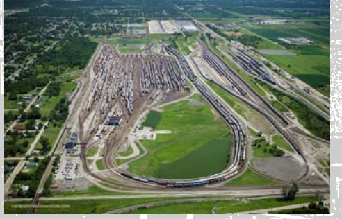
Alton & Southern Railroad Hump Yard